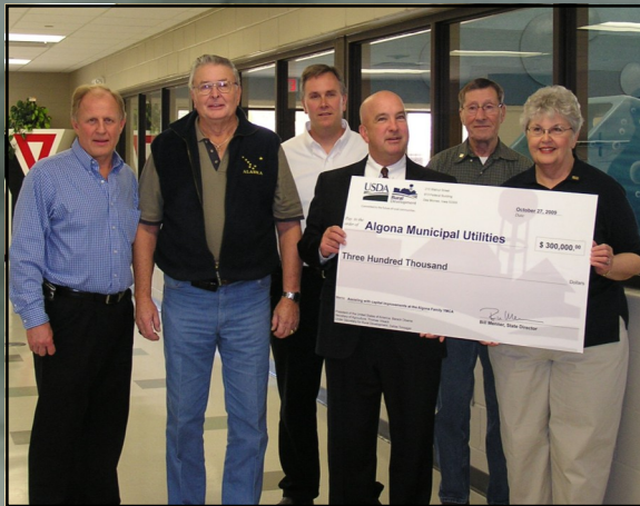
Algona Family YMCA Aquatic Center

Algona Municipal Utilities is committed to improving the economic growth, community vitality and overall sustainability of the Algona area.