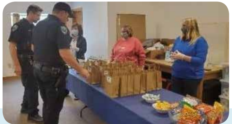
K/PACEDC staff and Board of Directors served an appreciation lunch to local law enforcements in Kossuth and Palo Alto Counties to show gratitude and support. Thank you so much for your service; we truly appreciate everything that you do!